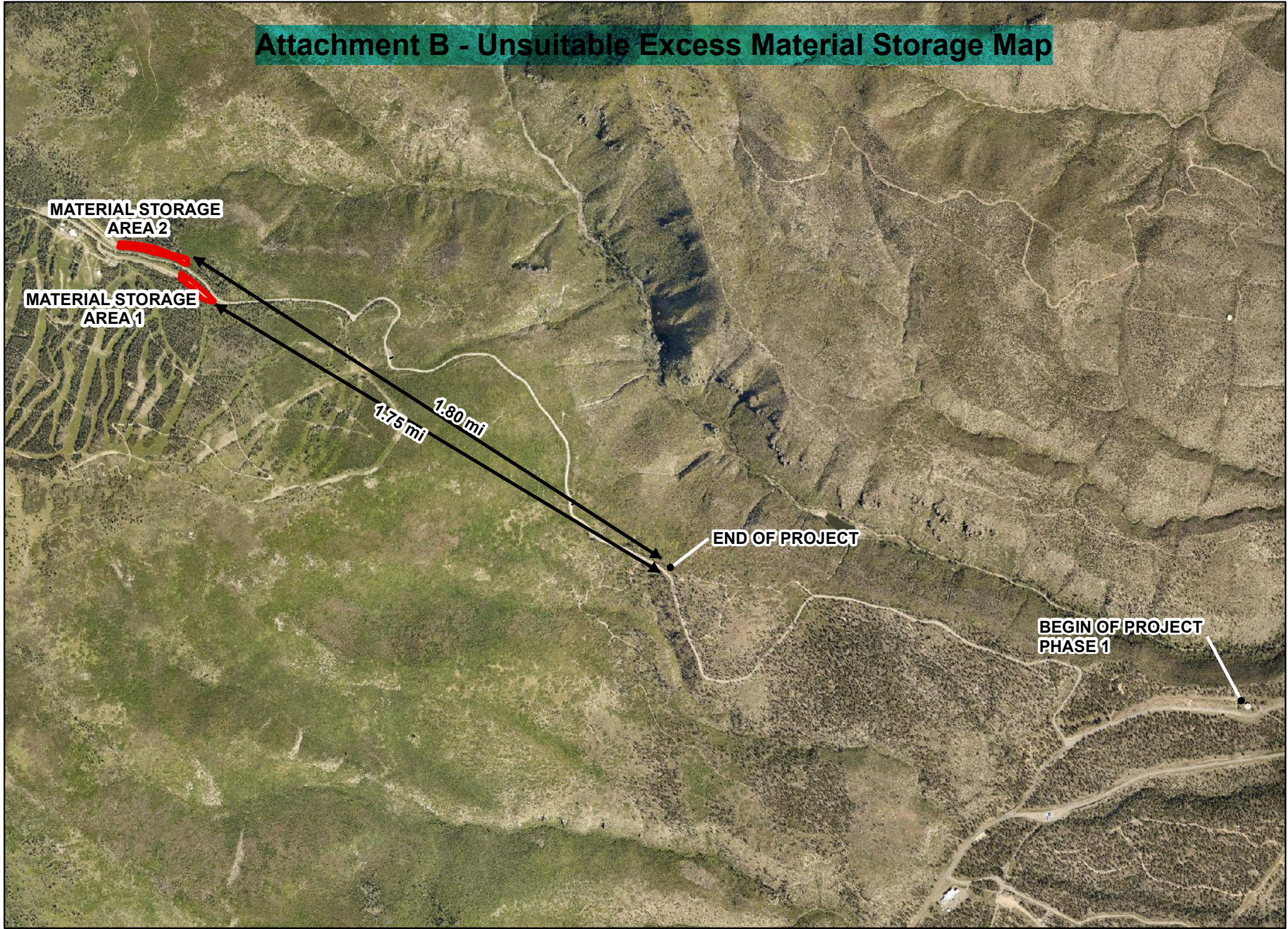
UNSUITABLE EXCESS MATERIAL STORAGE SITE MAP