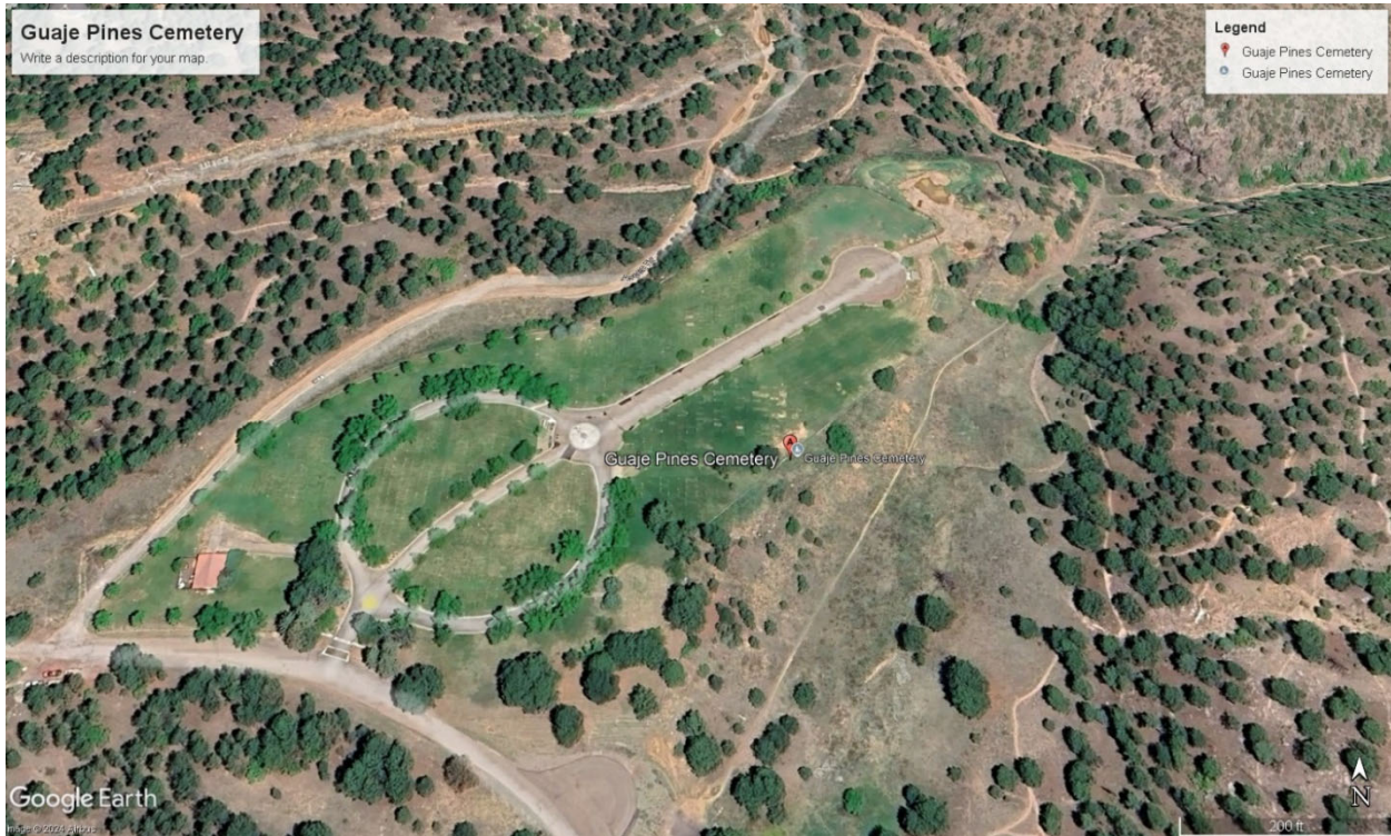
Exhibit F Guaje Pines Cemetery Site Map RFP NO: 25-37 RFP Name: Guaje Pines Cemetery Master Plan