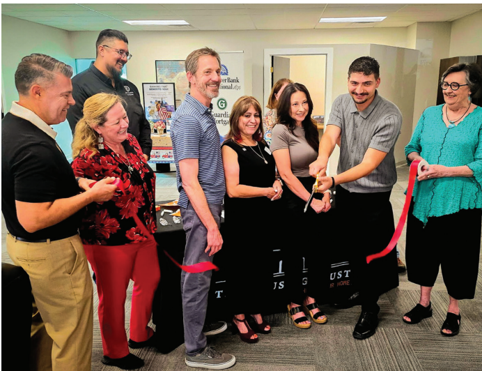
Bee City USA celebrates Earth Day at the Los Alamos Nature Center. | The Urban Trail Ribbon Cutting Ceremony was celebrated February 26, 2025. | County welcomes The Housing Trust to their new office space inside First National 1870.